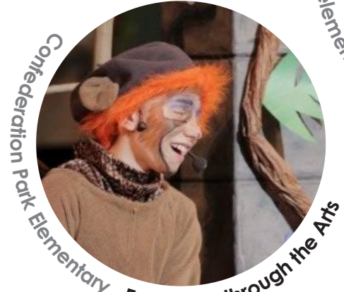
Confederation Park Elementary Education through the Arts