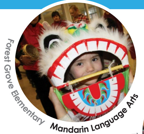
Forest Grove Elementary Mandarin Language Arts